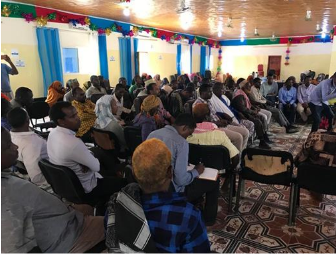
Last event of the Baidoa CAP review held in April 2019.

The participatory process did not specifically target returnees, but by involving returnee representatives in the community consultations, thus giving them a voice, it contributed to improving the returnees' sense of belonging to the community, and allowed them to express their main needs as any other group of the community.