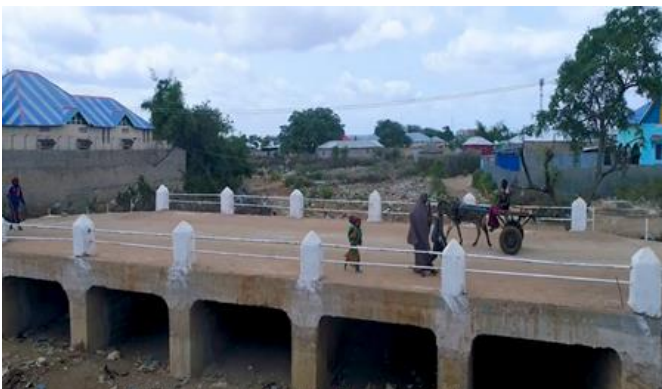
Kerowfogi bridge.

Complement public works with more specific assistance for returnees. Depending on the local context and returnees’ needs, it may be required to complement the benefits offered by the public/ infrastructure works with more specific, tailored assistance to returnees. This is particularly the case for migrants in situation of vulnerability who may need specialized medical or psychosocial support, for instance, as well as to support income-generating activities. Community infrastructures can help a long way in accessing markets or transporting some goods more easily, but in the absence of any seed capital to set up a business, the improved accessibility might not be of any particular help.