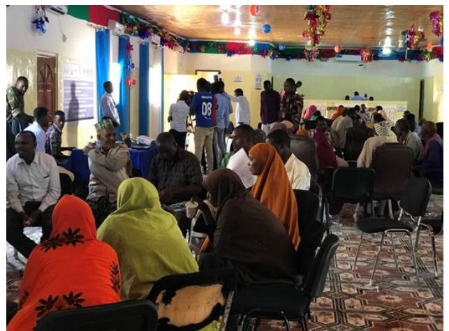
Group discussion during the CAP review event held in April 2019.

While CAPs are designed to bring to light communities' most pressing needs and priorities, more can be done to optimize their relevance and catalytic contribution to durable solutions for local communities, returnees and displaced persons. Building the capacity of Core Facilitation Teams and Community Action Groups to apply independently an approach which addresses widespread and cross-cutting challenges to survival, livelihood and dignity of their community, can enhance the development of CAPs by framing them more clearly as tools to achieve durable solutions.