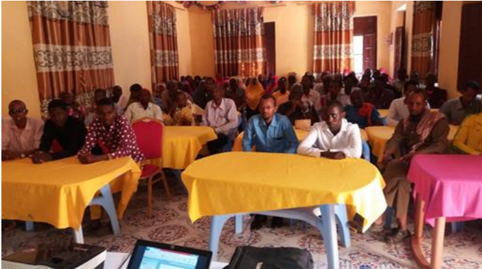
Pre-planning session held in May 2017, gathering different socio-economic groups including IDPS, host community, returnees and Baidoa local authorities.

In addition, IOM rolled out a Community Involvement Survey between 30 th November and 4 th December 2019, reaching 399 community members. More information is provided in the section 'Outcome and Evidence' further below.